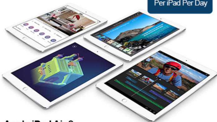
Apple iPad Air 2